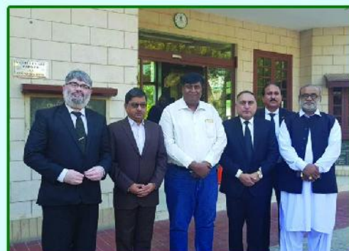
VISIT OF DEVELOPMENT SCHEMES FOR DISTRICT ATTORNEY AND PROSECUTION, HYDERABAD