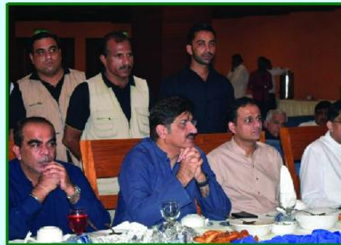
CHIEF MINISTER WITH ADVISOR FOR LAW AND MINISTER EXCISE & TAXATION DURING PRESS CONFERENCE