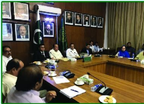
WORKSHOP ON CAPACITY BUILDING OF LAW DEPARTMENT OFFICERS BY EX-LAW SECRETARY SAYED GHULAM NABI SHAH