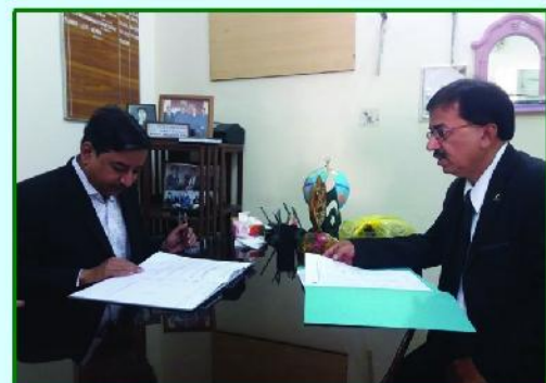
OFFICIAL VISIT OF DISTRICT ATTORNEY OFFICE, SUKKUR